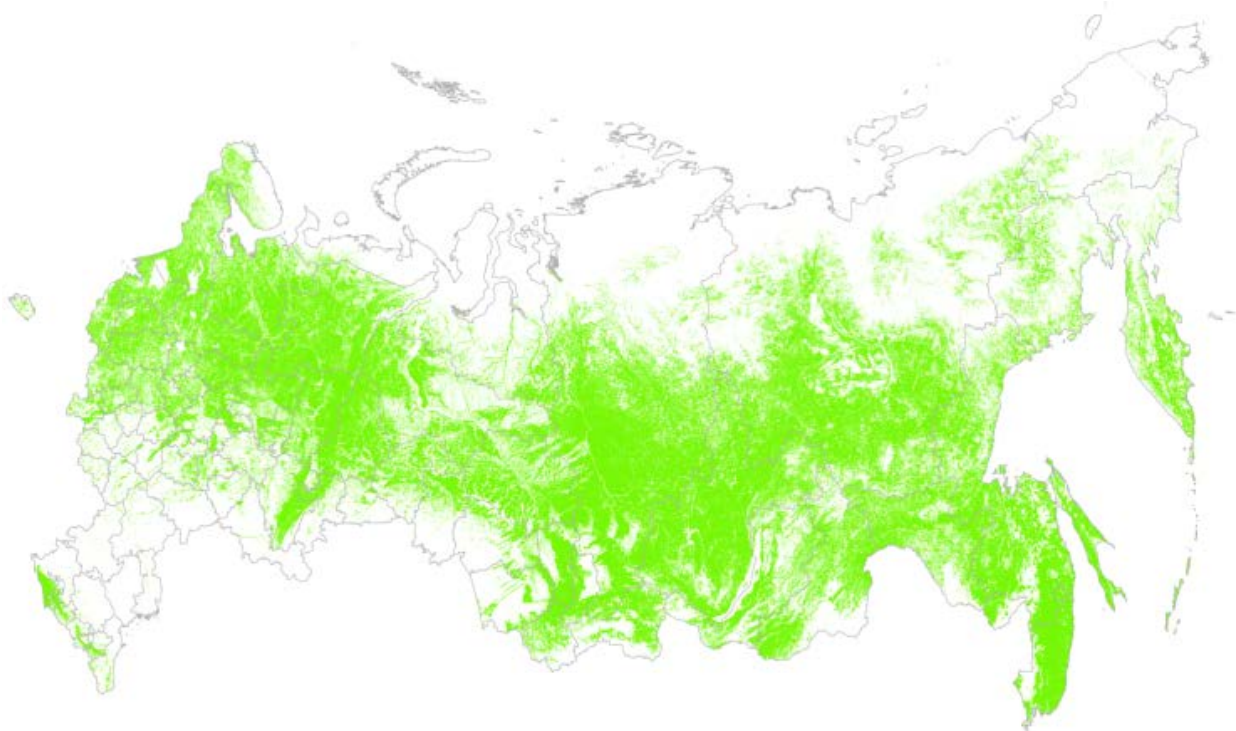
Fig. 2. Hybrid forest/non-forest map of Russian forests is available for browsing and download in full resolution (230 m) at: http://Russia.geo-wiki.org

The lower estimates of forest area in the Asian area is very likely due to natural and anthropogenic disturbances, mainly wildfire, biogenic (insects/diseases) factors and industrial development. About 2.5 million hectares of forest a year have been lost to wildfires over the past