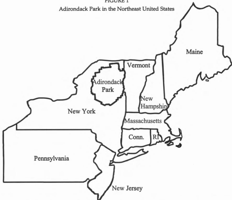
FIGURE 1 Adirondack Park in the Northeast United States

The current state of the Adirondack region of northern New York mirrors much of the 26 million acre Northern Forest—stretching from Lake Ontario to the coastline of Maine. The northern rural economy is characterized by a number of land-use and related economic trends, including: