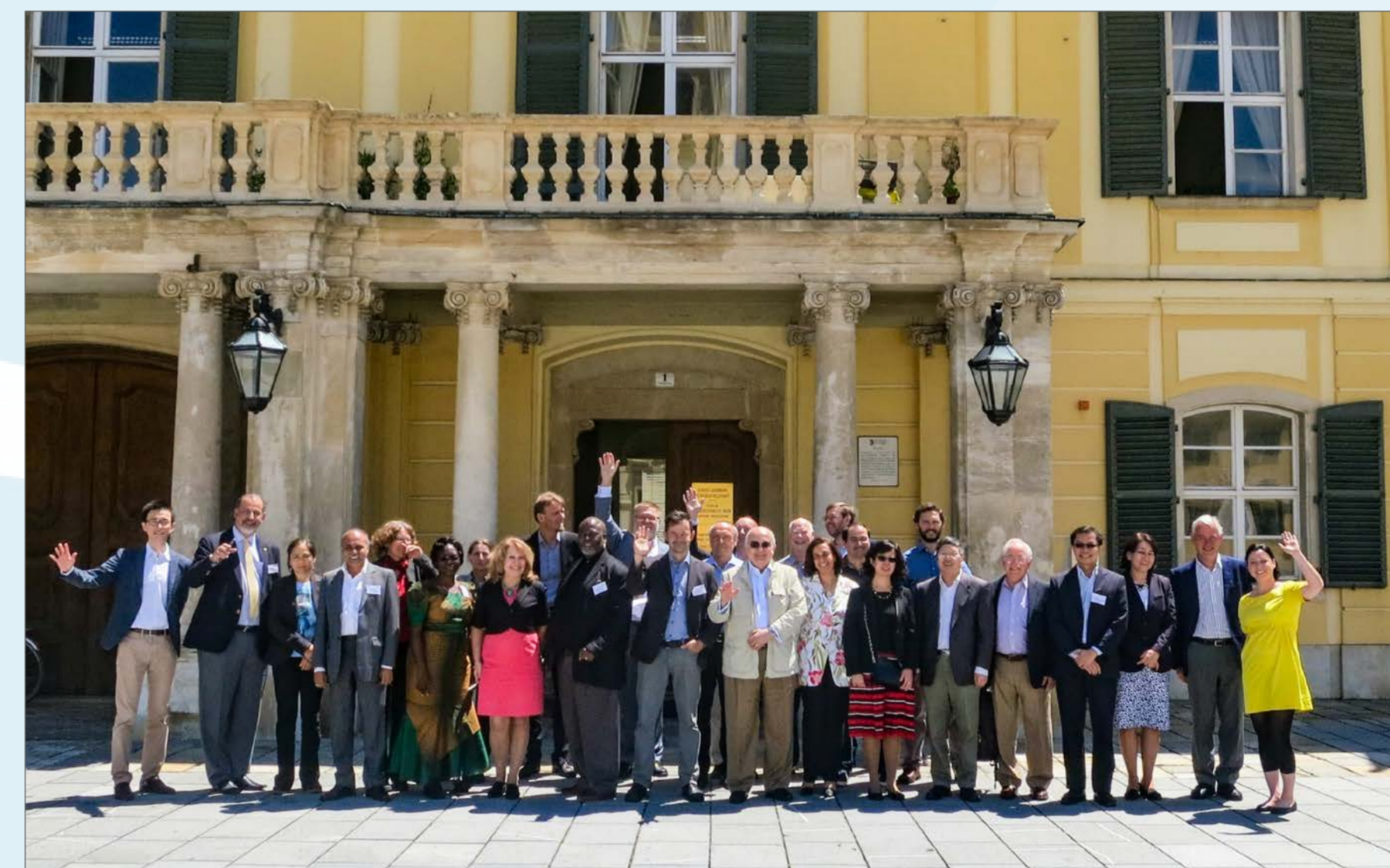
Laxenburg, Austria 14/06/2016. 2nd WFaS Scenario Focus Group Meeting

The work results in the development of a tool to reflect regionally relevant information on water management options and solutions and associated investment needs.