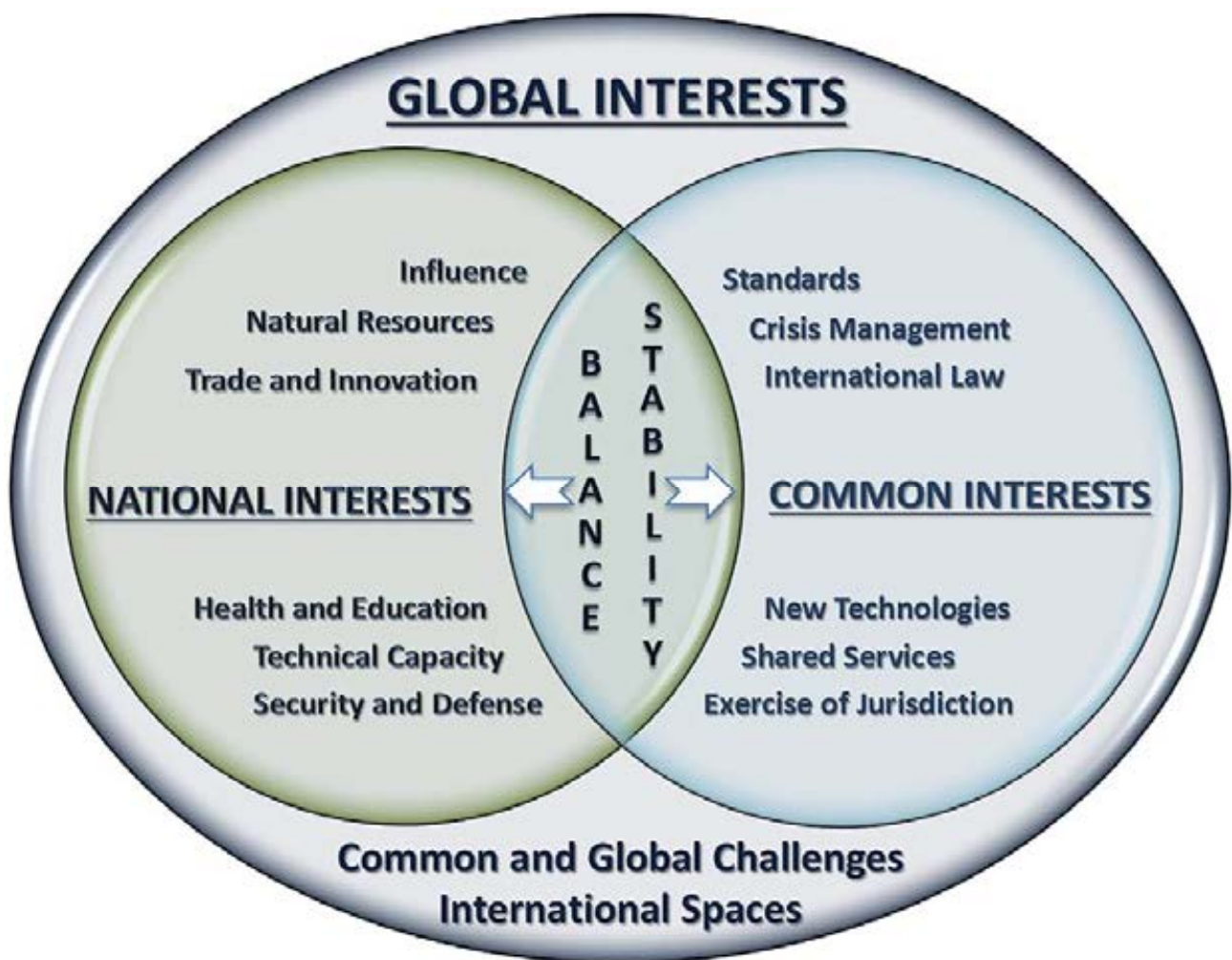
FIGURE 5: Global interests of our civilization – which is now interconnected across the Earth (Fig. 1) – require balance between national interests and common interests with urgencies across security and sustainability time scales (Fig. 2). Before such balance can be achieved, the first step is build common interest among nations, which is an important result of science diplomacy, promoting cooperation and preventing conflict. Such balance and stability in our world involves evidence from the natural and social sciences along with integration of stakeholder perspectives and governance records that contribute to informed decision-making (Fig. 3) for the benefit of nations individually and collectively.

Among the nearly 200 nations in our world, seven Foreign Ministers now have S&T Advisors. The Vienna Dialogue (Table 1) is a tribute to Dr. Vaughan Turekian (United States), Sir Peter Gluckman (New Zealand), Prof. Robin Grimes (United Kingdom), Dr. Teruo Kishi (Japan) and Prof. Aminata Sall Diallo (Senegal). These S&T Advisors to Foreign Ministers and their predecessors are the pioneers of a global network (Table 3), establishing a new level of diplomacy across foreign ministries 33-34 at the intersection of national interests and common interests on a global scale (Fig. 5).