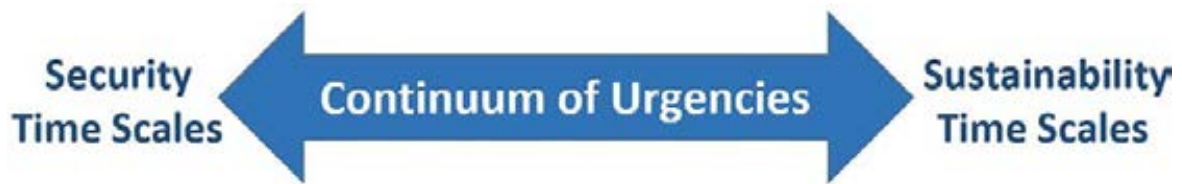
FIGURE 2: In our globally-interconnected civilization today, urgencies exist simultaneously across security time scales (mitigating risks of political, economic and cultural instabilities) and sustainability time scales (balancing societal, economic and environmental elements across generations) that must be addressed by nations individually and collectively.

In our globally-interconnected civilization – where urgencies of the present and future meet today (Fig. 2) – science and technology (S&T) advice in foreign ministries is part of the solution to address the issues, impacts and resources within, across and beyond the boundaries of nations. 10 In foreign ministries, the ‘evidence brokers’ are the science and technology advisors to foreign ministers.