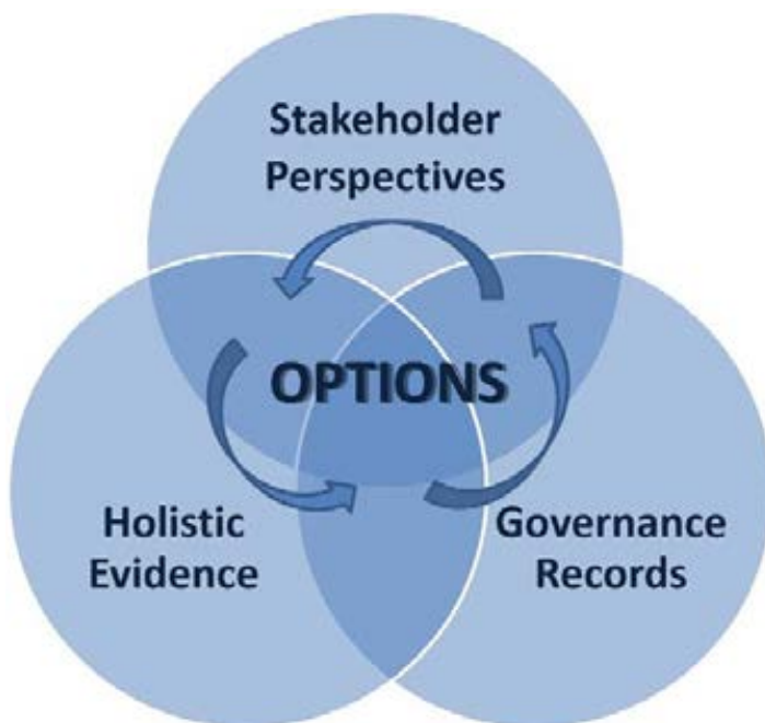
FIGURE 3: Iterative decision-support process involving international, interdisciplinary and inclusive (holistic) evidence from the natural and social sciences that is integrated with governance records (policies, regulations and laws of governments) in view of stakeholder perspectives to reveal options (without advocacy) that contribute to informed decision-making for the foreign affairs of nations.

In a general sense, options are integrated through a decision-support process (Fig. 3), responding to constantly changing circumstances within, across and beyond the boundaries of nations. This iterative process involves stakeholder perspectives; evidence that is holistic (international, interdisciplinary and inclusive); and governance records.