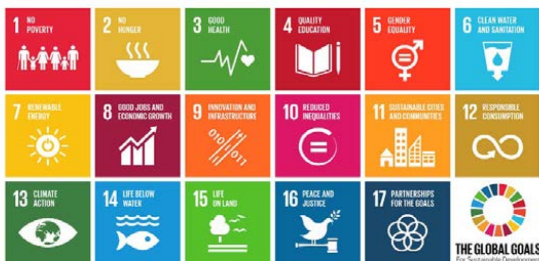
FIGURE 4: The 17 Sustainable Development Goals established by the United Nations in 2015. 26

In an holistic manner, the Sustainable Development Goals (Fig. 4) are characterized as a “ knowledge platform... a plan of action for people, planet and prosperity. ” While they were crafted in a political environment with urgencies of the moment – these goals offer humankind a timeless gift that is purposeful today and will continue to be so into the distant future.