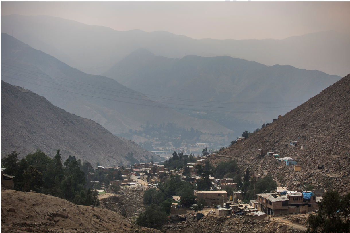
Figure 1: Peri-urban settlement in a huaico-exposed valley outside Lima, Peru.

households (Hawley et al., 2018; Seminario and Ruiz, 2008). Despite the illegality of these invasions, municipal governments and other authorities responsible for providing land titles and certificates of possession to homeowners often support such occupations through formal recognition of tenancy or ownership (Calderón, 2013). With this recognition, households can legally connect to public services and utilities (Calderón et al., 2015); and, as communities become permanently established and expand, public institutions such as schools and health centers may locate nearby. Moreover, once established, the relocation of even the most severely exposed communities has proven difficult for policymakers and risk managers (e.g. La República, 2016).