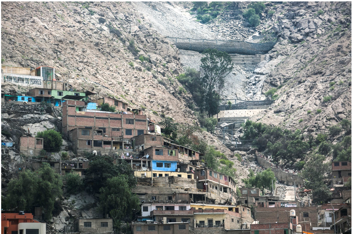
Figure 3: Geodynamic barriers in the Carosio quebrada of Chosica, Peru.

financing and loans totaling almost US$ 20 million to local service providers for the relocation and reinforcement of treatment plants and other infrastructure, as well as the cleaning of sewage systems and storm-water drains (MVCS, 2016). With support from the private sector, the Ministry of Housing also supplied eight portable water treatment systems, five drain-cleaning systems, and cistern trucks to departments that had suffered potable water shortages and related disease outbreaks during the 1997-98 event (MVCS, 2016). In one high-profile example of new infrastructure development, the National Water Authority installed 22 steel geodynamic barriers in valleys outside Lima to protect populations exposed to huaicos (ANA, 2016) (Figure 3) 16 .