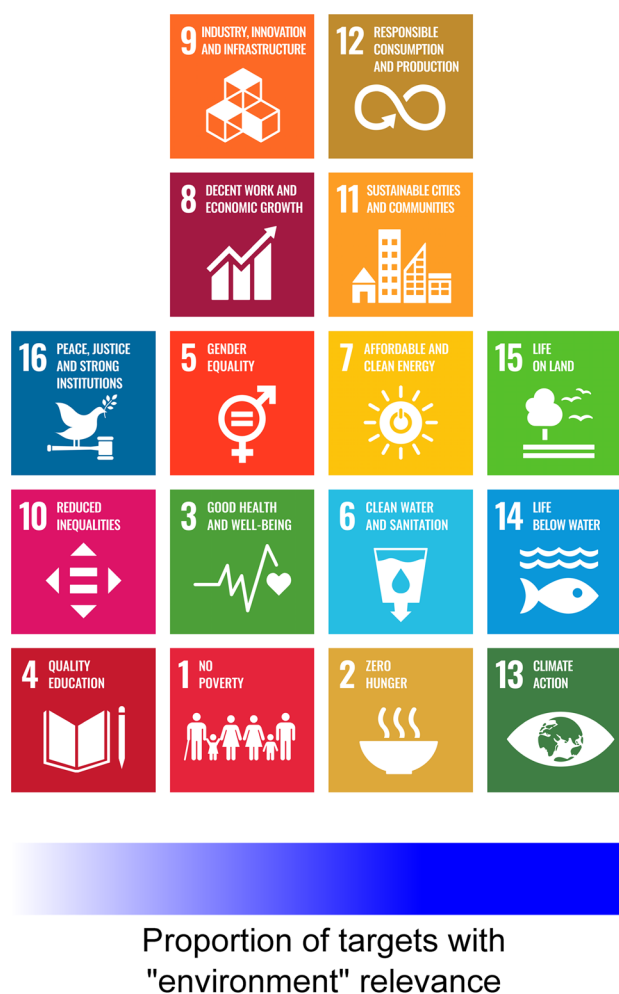
Fig. 2 The importance of environment within each SDG, based on a textual analysis of SDG target wording (as per UN 2015). The vertical scale is linked to the proportion of targets within each SDG that contain at least one environment-related word (Environment-related words were counted within each SDG target, and include: air, animal, aquaculture, aquifer, biodiversity, clean energy, climate, coastal, communicable disease, drought, dryland, ecosystem, environment, fauna, fish, flood, flora, forest, genetic diversity/resources, green space, hepatitis, lake, land, livestock, local product, malaria, marine, mountain, natural, nature, neglected tropical disease, ocean, pastoralist, peri-urban area, plant, renewable energy, resource, river, rural area, sea, seed, services, soil, species, terrestrial ecosystem, tuberculosis, water, weather, wetland, wildlife. The count included close relatives of each word, e.g. *fish* also selected fishing, fisheries, overfishing, etc.), and ranges from no mention of the environment (SDGs 4, 10, 16) to environment mentioned throughout (SDGs 13, 14, 15)

To assess the environment–human aspects of the interactions between SDGs, we applied the logic explained above but focused only on action related to the environment–human linkages rather than the full range of possible actions to advance any one SDG. For example, some action used to achieve good health and wellbeing (SDG 3) is related to the environment–human linkages, e.g. vector