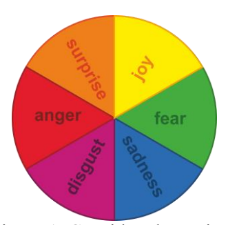
Figure 1. Considered emotions