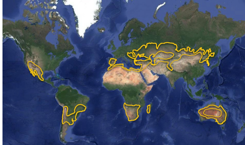
Figure 1: The mid-latitude ecotone.

In a study conducted as part of the ClimaEast project, IIASA researchers, together with Ukrainian colleagues,