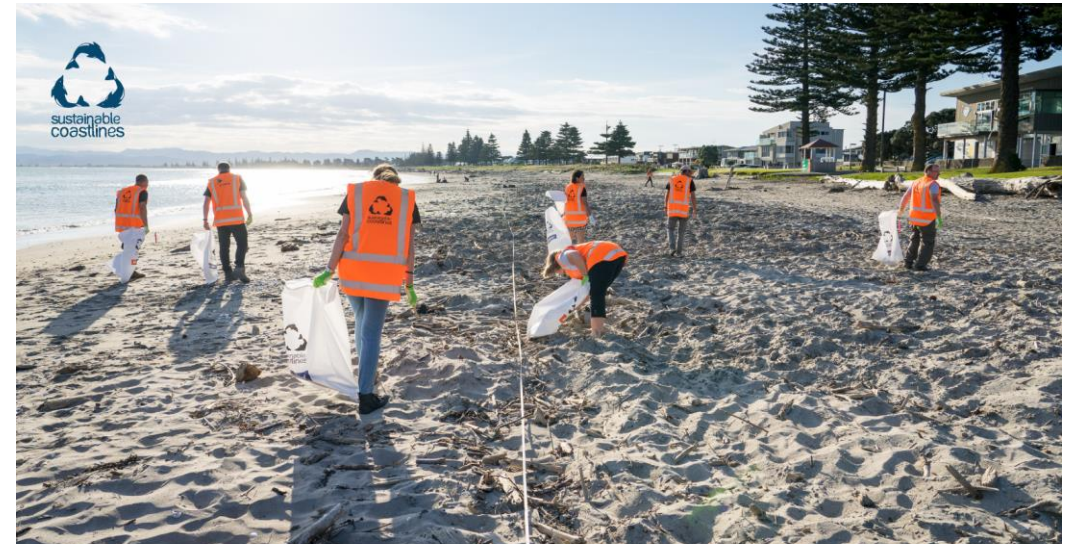
LITTER SURVEY #01 • 25 October 2018 • Waikanae Beach, Gisborne, New Zealand www.sustainablecoastlines.org/litterproject

Fraisl, D., Campbell, J., See, L. et al. Mapping citizen science contributions to the UN sustainable development goals. Sustain Sci 15 , 1735–1751 (2020). https://doi.org/10.1007/s11625-020-00833-7