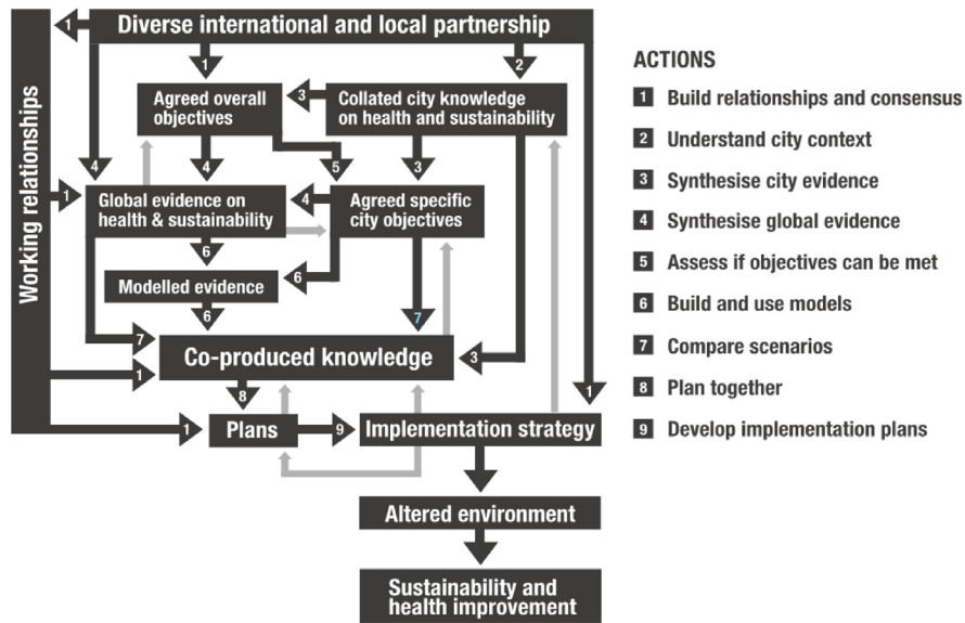
Figure 1. Action model for Complex Urban Systems for Sustainability and Health (‘CUSSH’). Dark arrows are actions. Light arrows are examples of feedback.