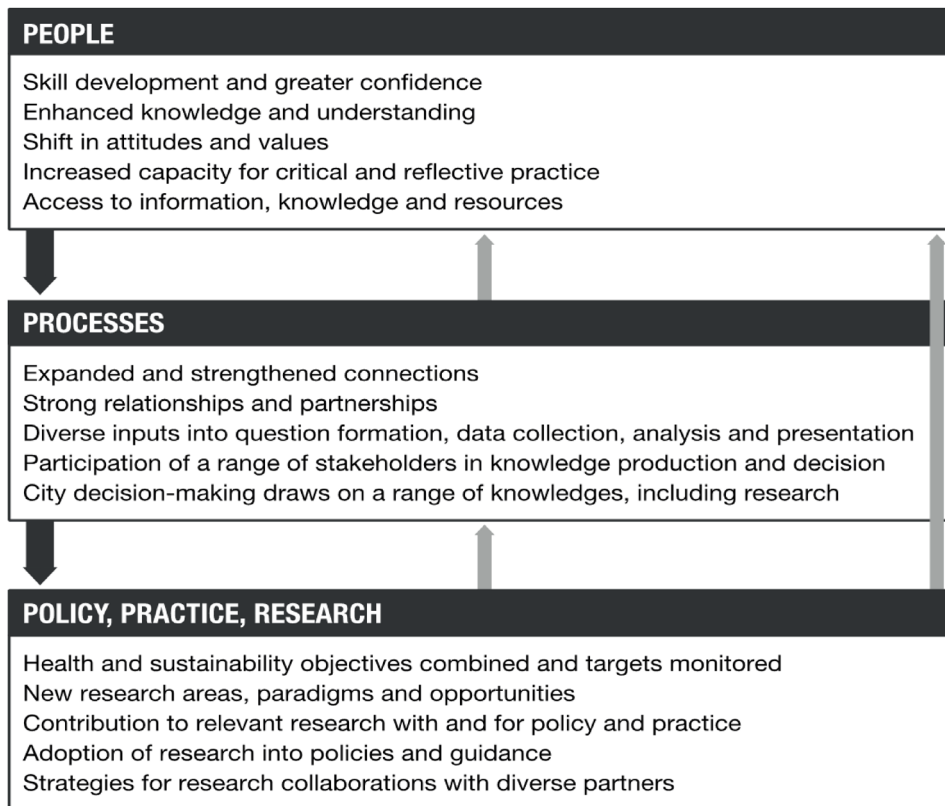
Figure 2. Change model for Complex Urban Systems for Sustainability and Health (‘CUSSH’). Dark arrows are feed-forward. Light arrows are feedback.