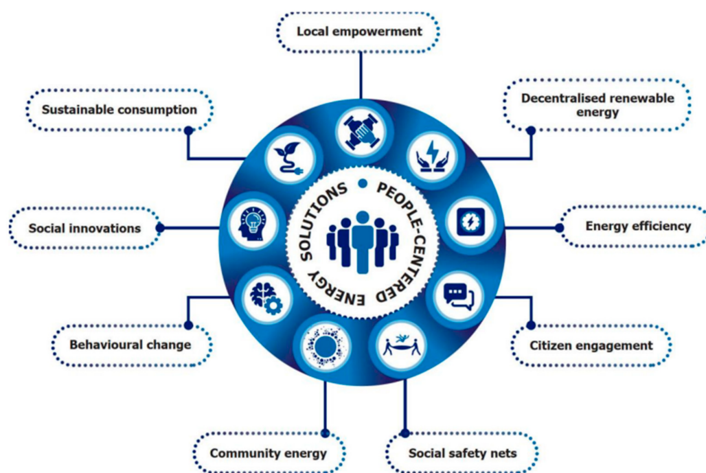
Figure 2. The role of people in bridging different elements of sustainable energy transitions [9].

Similarly, the energy transition is leading to and is spurred by various forms of social innovation (i.e., ideas, products, services, or models) that meet social needs and create new collaborations [135]. Examples relevant for the energy transition include energy cooperatives, energy “prosumers” consuming and producing energy, citizen science applications, living labs, and new participative forms of decision-making, such as citizen assemblies and local energy fora [136,137]. Figure 2 illustrates the role of people in enabling sustainable energy transitions.