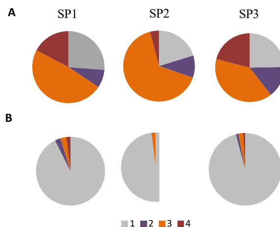
Fig. 2. Ratio between snag stages on the sample plots before (A) and 7 years after the fire (B): SP1-SP3 – sample plots according to Table 1.

Significant changes were observed in the structure of the snag stock. If before the fire most of the snags belonged to the 3rd stage (39.5-65.7%) (Fig.3A), the 7 years after the fire about 93-98% of snags was dead trees of the 1st stage (Fig.2B). This indicates that 7 years is too short for snags to lose twigs and branches (to shift the snags from the 1st to the 2nd stage). So organic matter (carbon) accumulated in these twigs is preserved from the fast decomposition at least for 7 years after fire and these fine woody debris do not supply to the ground fuel load.