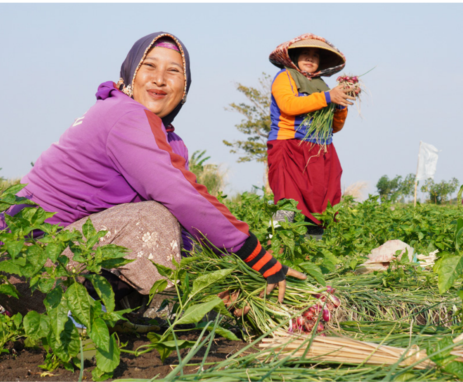
Group of farmers in Brebes, Indonesia, harvesting shallot.