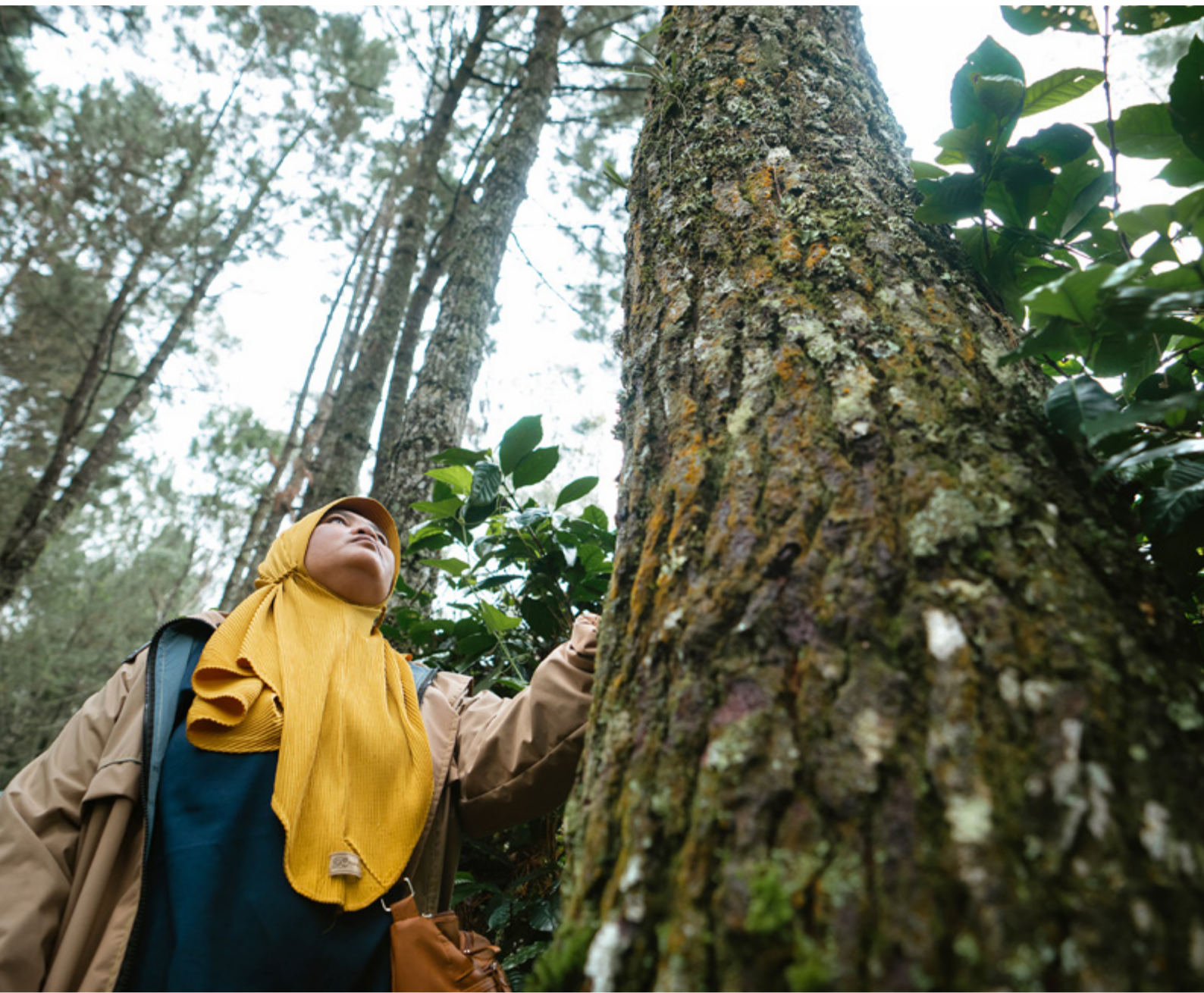
Agroforestry site in the social forestry community Ciwidey, West Java, Indonesia.