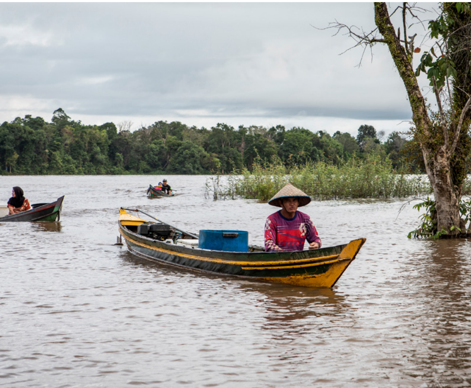
Fishers transporting their capture by boat to a traditional fish market near Dusun Hilir Subdistrict, Barito Selatan, Indonesia.