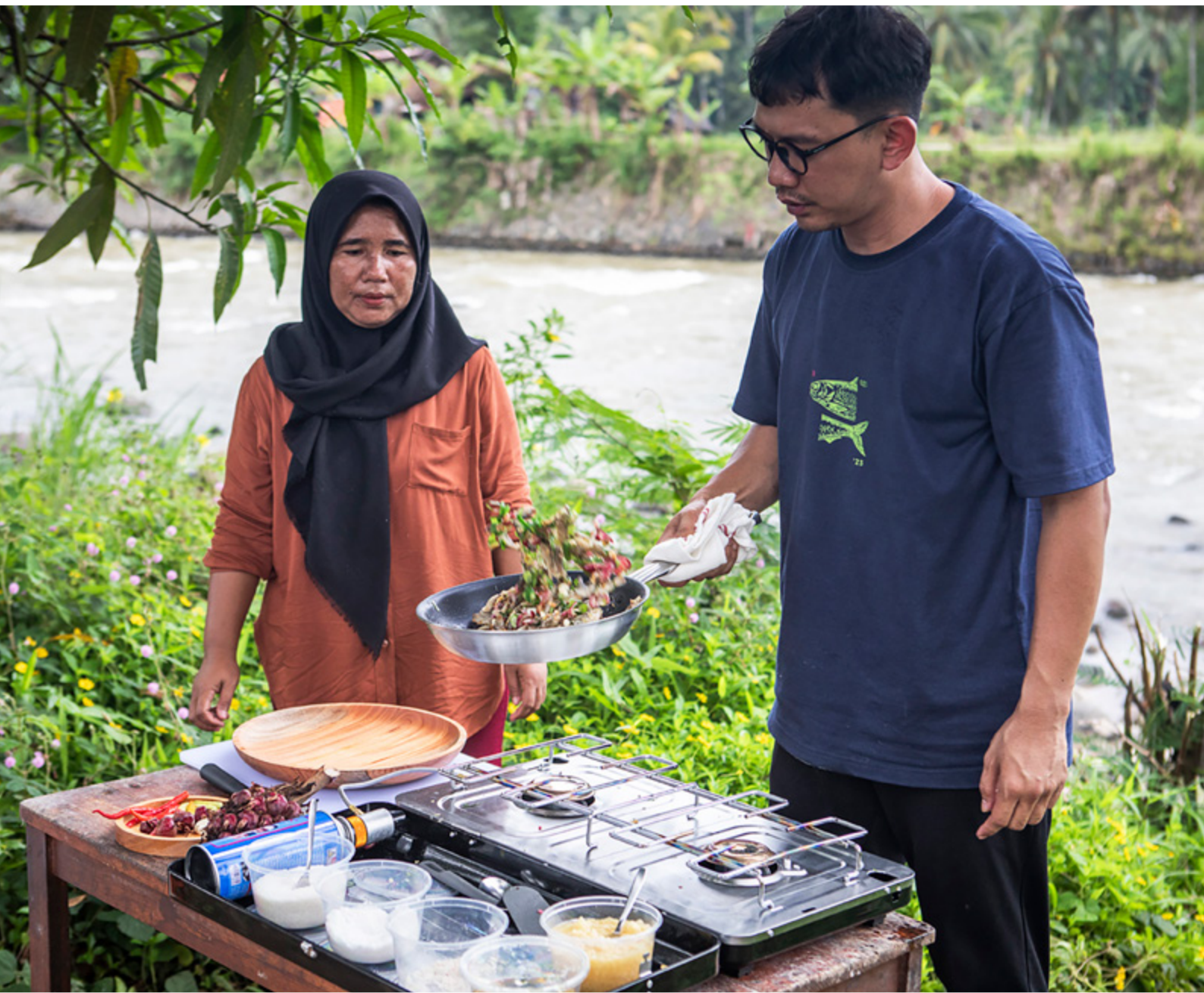
A meal being prepared with Barbodes binotatus fish captured in Cibareno River in Sukabumi District, West Java, Indonesia.