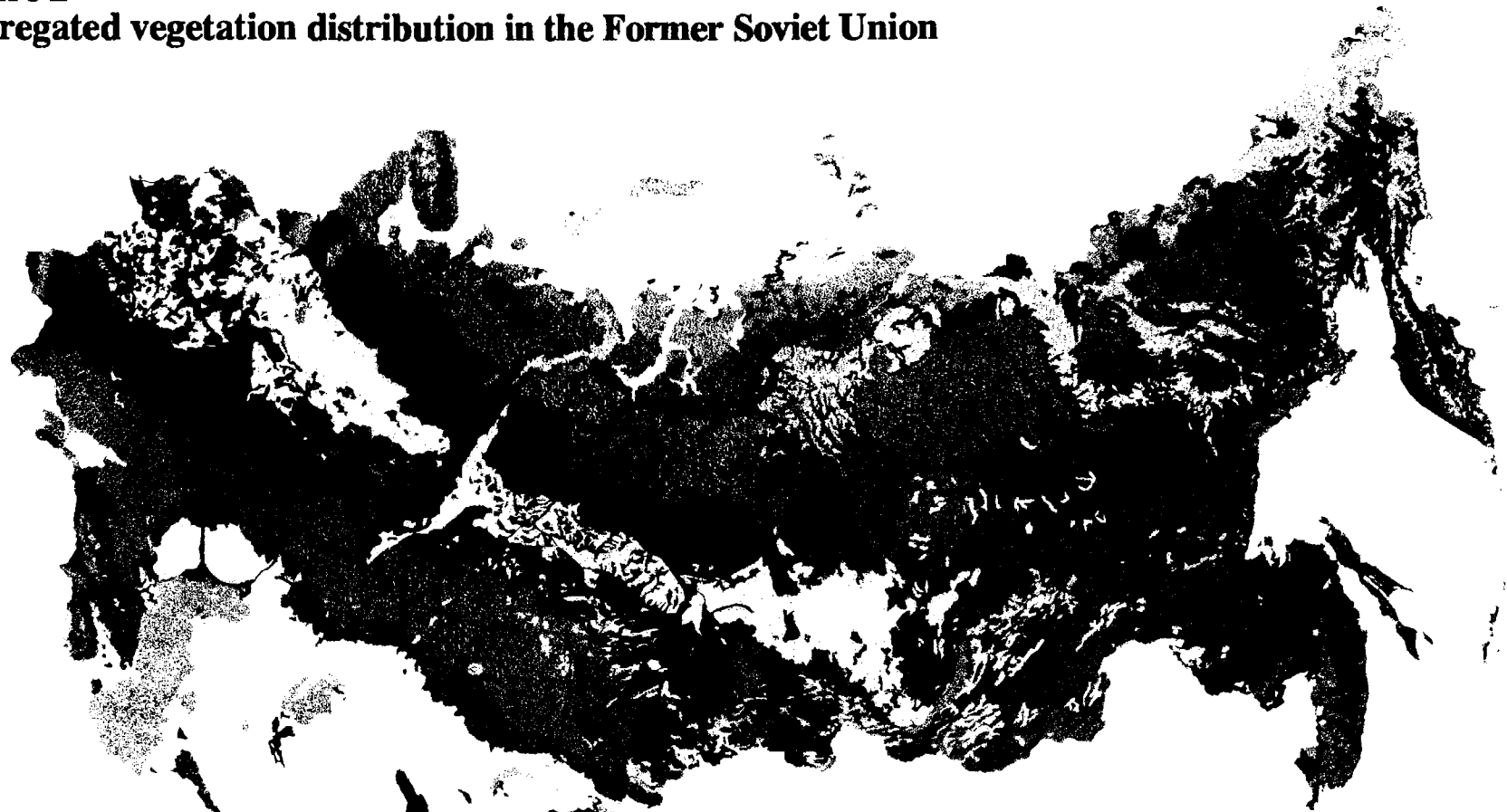
Figure 2 Aggregated vegetation distribution in the Former Soviet Union