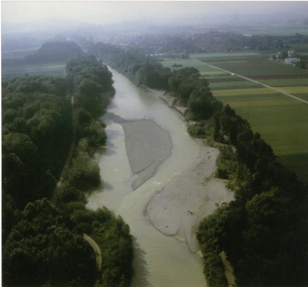
FIGURE 3 The result of a “Space for Rivers” initiative in Switzerland: the resilience of the Emme valley to flooding has been increased by allowing part of the Emme to return to its natural riverbed. This structural measure is cost-efficient, protects the river against undesired influx (thus improving water quality), helps conserve a natural ecosystem, and improves the quality of recreation areas. View of the Emme near Utzenstorf.

rather than certainties. Both the Netherlands and Switzerland offer good examples (“Space for Rivers” initiatives) of stakeholder-driven collaboration between society and scientists that is developing innovative approaches to flood hazards (Figure 3). Recognizing that engineered solutions cannot deliver full flood security, these programs allow experimentation with new policies and practices that increase society’s resilience to floods and