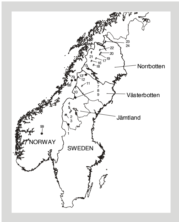
Figure 1. Location of study sites in Sweden (# 1-24) and in Norway (# 79, 89 and 99). Solid dots represent sites where harvest data on willow grouse were collected, and squares represent line-transect sites.

to be counted in any one year, and information on breeding success can still be included when planning harvest management.