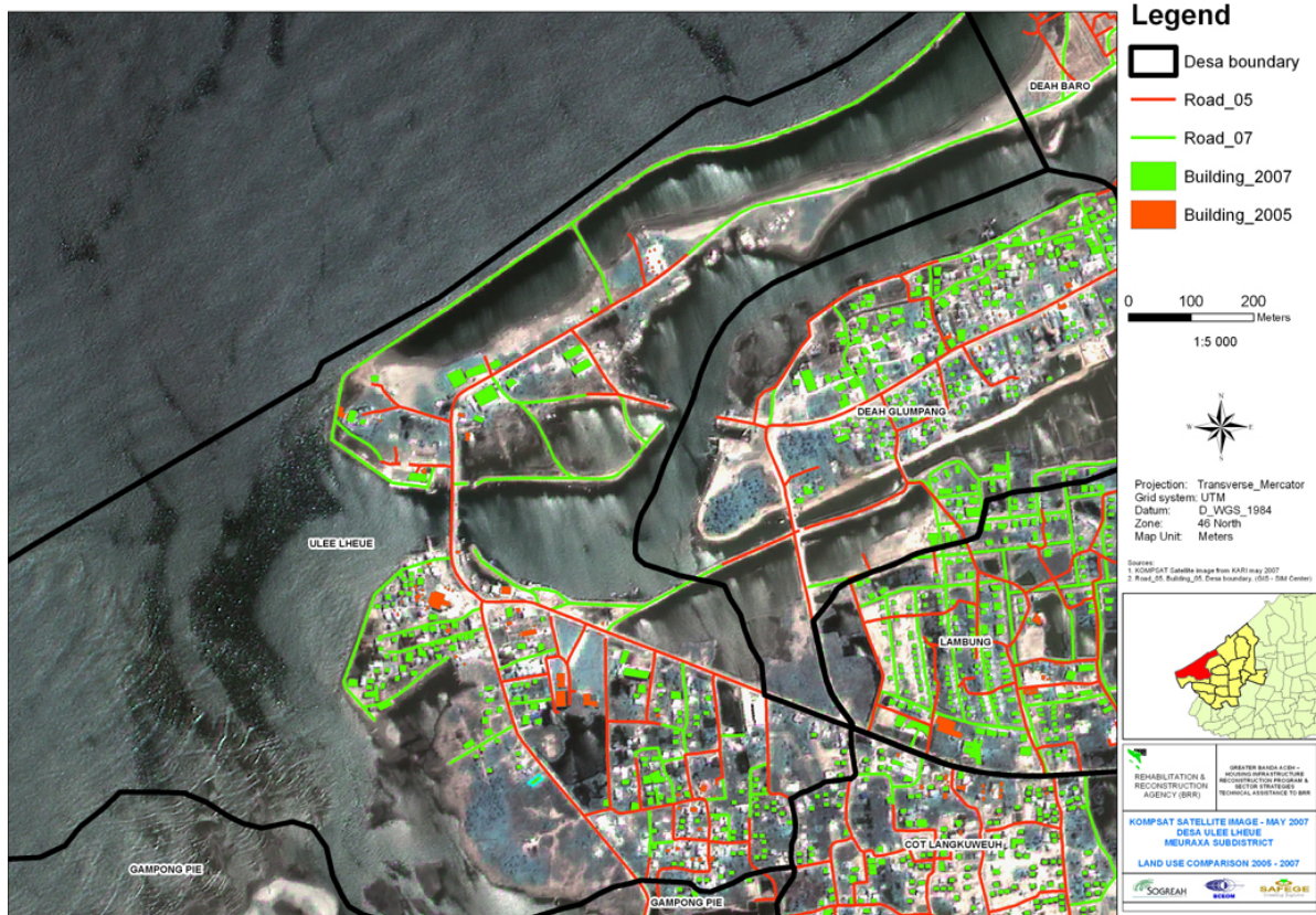
Figure 4: Ulee Lheue village buildings and roads comparison 2005–2007; KOMPSAT satellite imagery of Banda Aceh (22 May 2007), city mapping derived from orthorectified aerial imagery (June 2005).

The cost effort to produce mapping from earth observation and GIS: