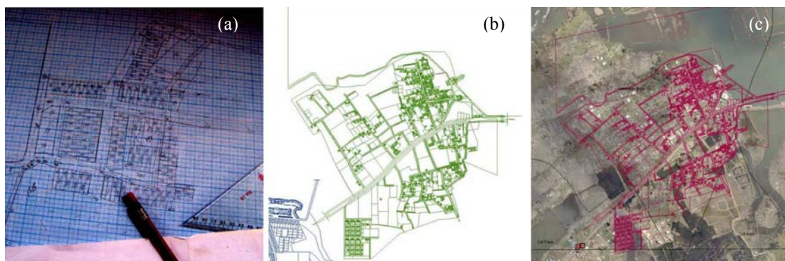
Figure 3: (a) Creation of a simple community based land ownership map (part of); (b) CBM converted to AutoCAD to record land ownership agreement and details; (c) CBM rectified using orthorectified aerial photography.

A comparison, in terms of effort, for the acquisition of the information to allow for the creation of this tool via traditional survey methods and via the use of earth observation and GIS techniques can be made.